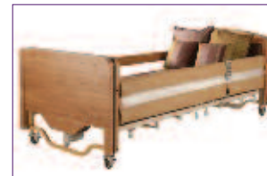
Side rail pads